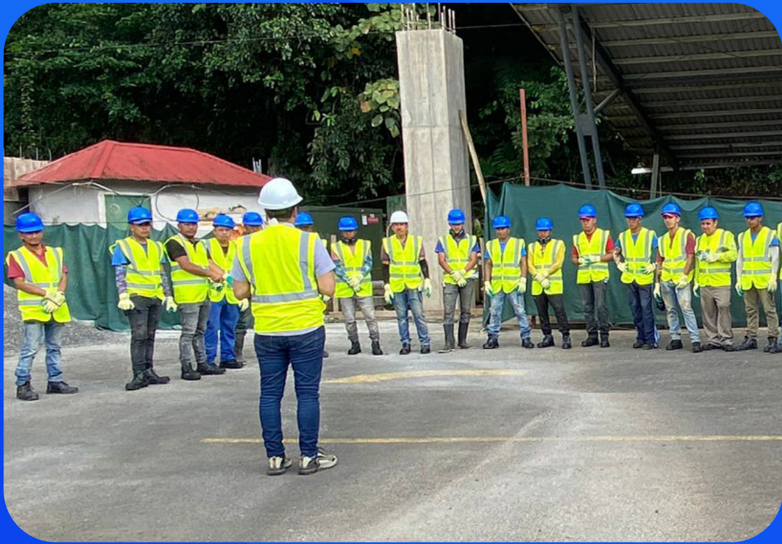
Use of Personal Protective Equipment

We want our personnel to have support that enhances their work capacity and that people can perform in a safe work environment that promotes and protects the physical, mental and social health of our team.