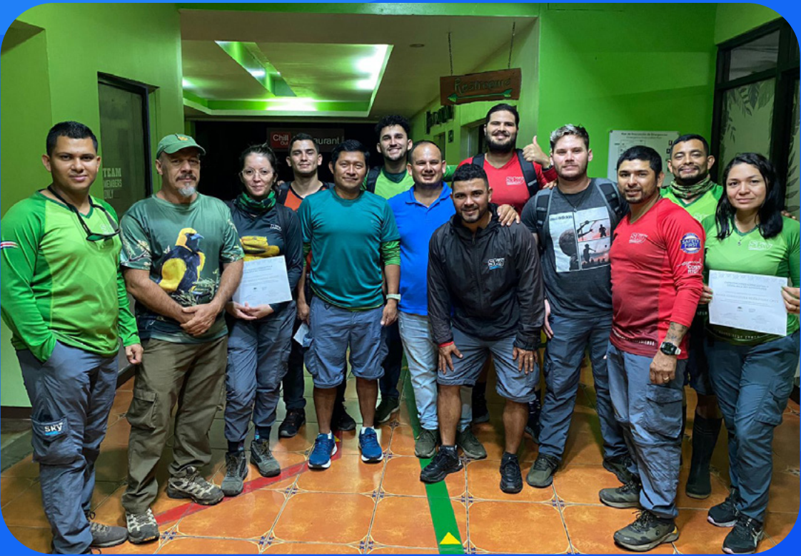
Costa Rica Sky Adventures Staff

During 2023, we had a staff of 145 people, professionals who throughout the year were able to expand their knowledge and grow within the company. In addition, 90 new hires were made during this period, providing new opportunities for people from the area and the country in general.