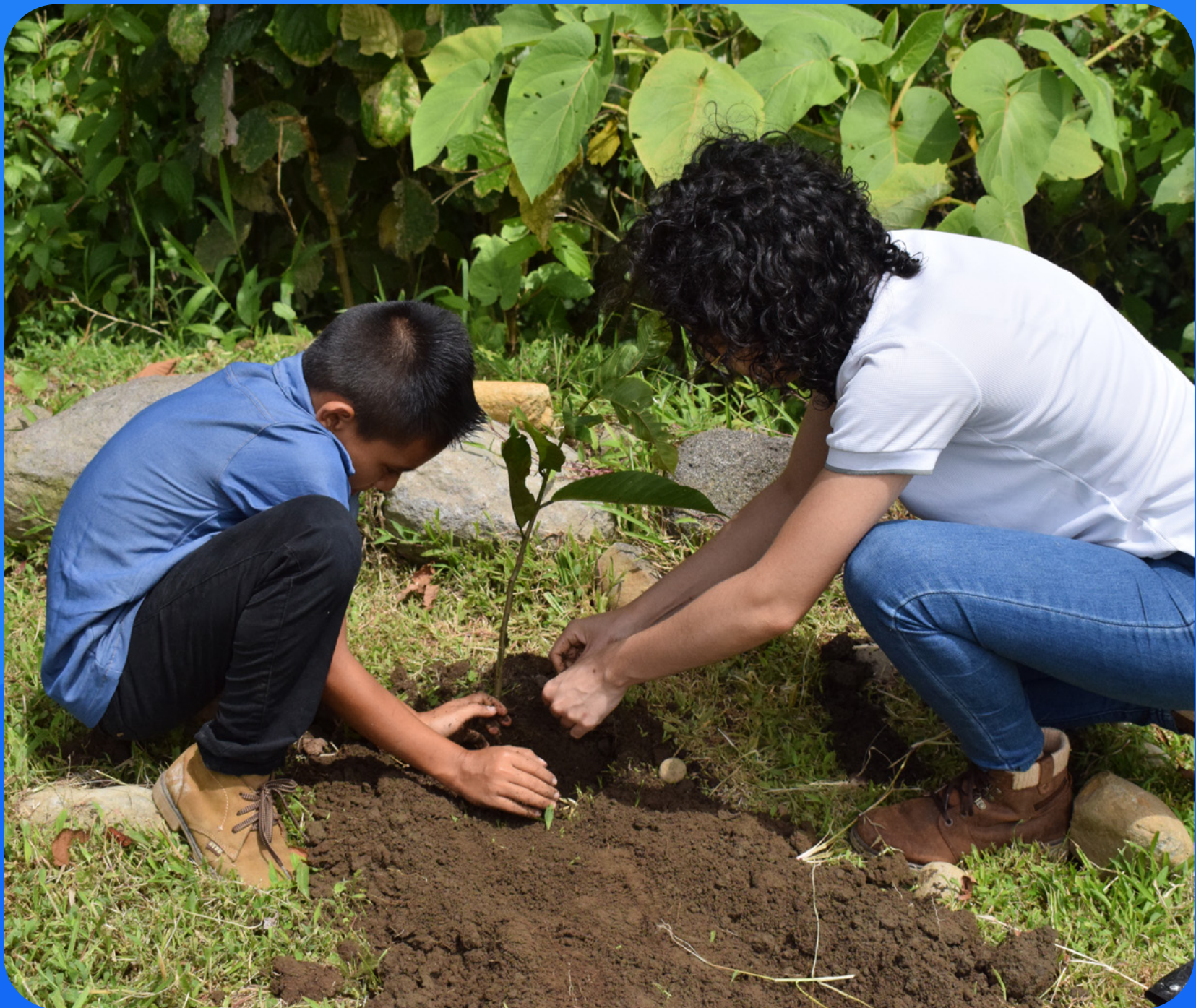
Tree Planting Reforestation Volunteering at the Lake Project, El Castillo