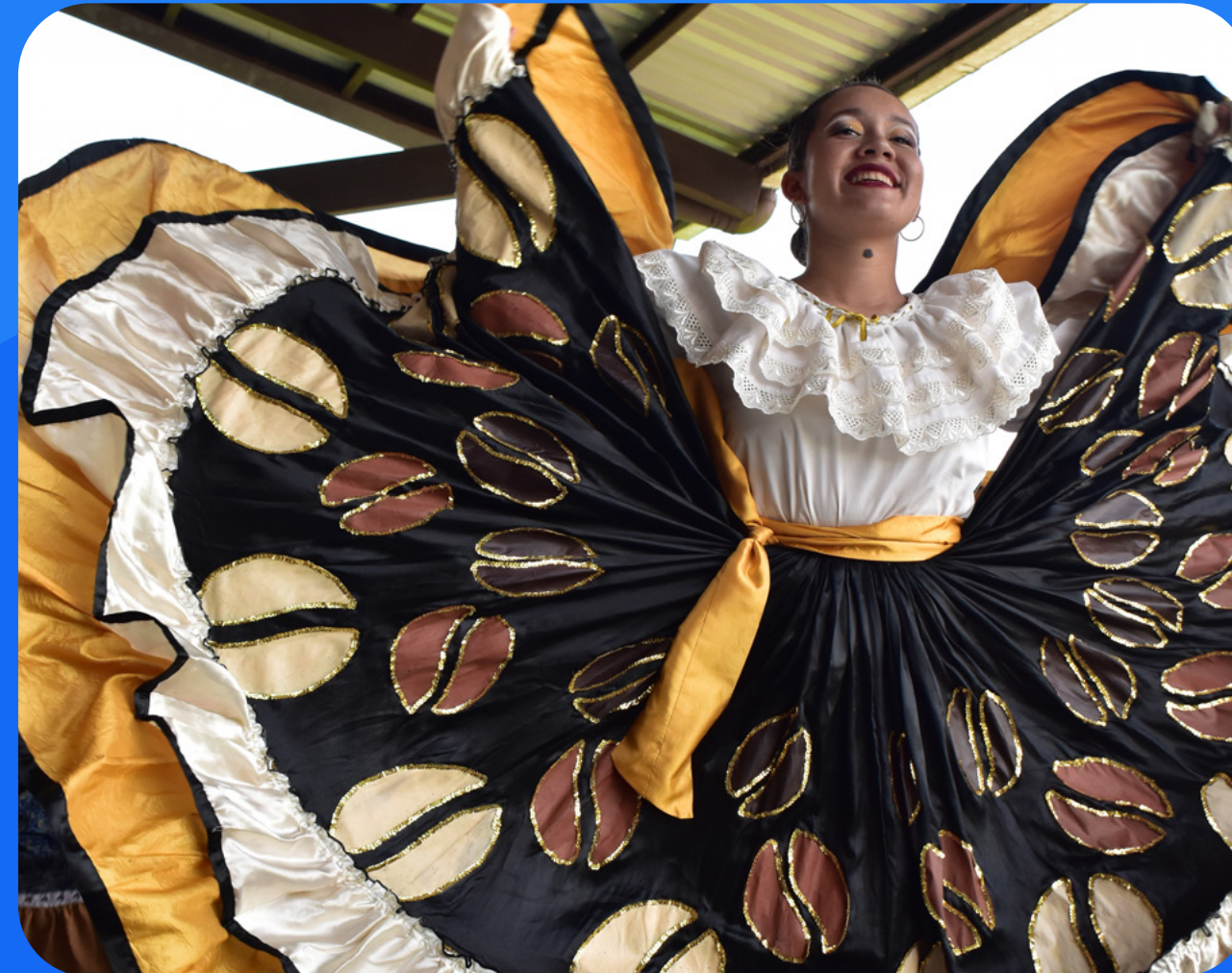
Celebration of Costa Rica's 202 years of Independence at Sky Adventures