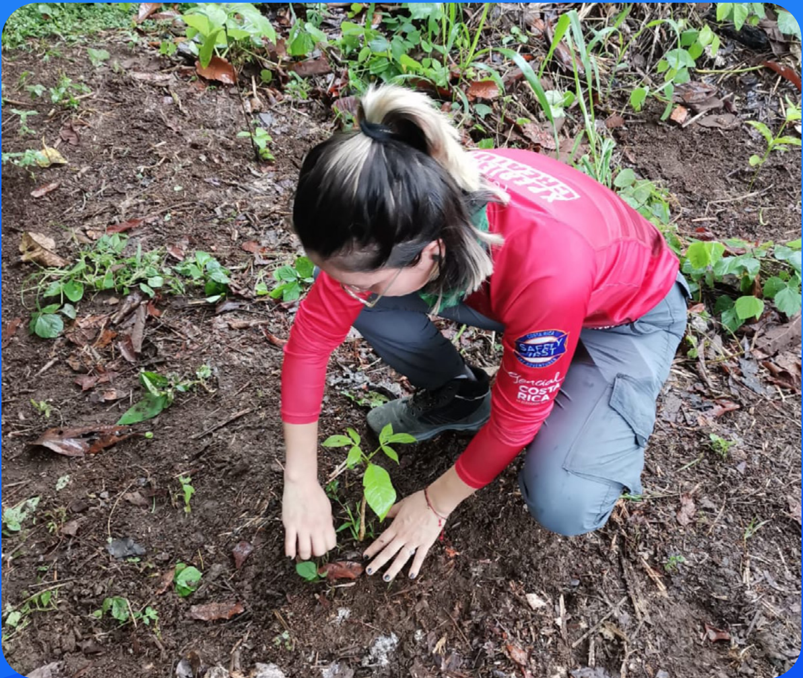
Planting of about 50 Pollinator Plants in the Río Danta Biological Corridor in La Fortuna de San Carlos