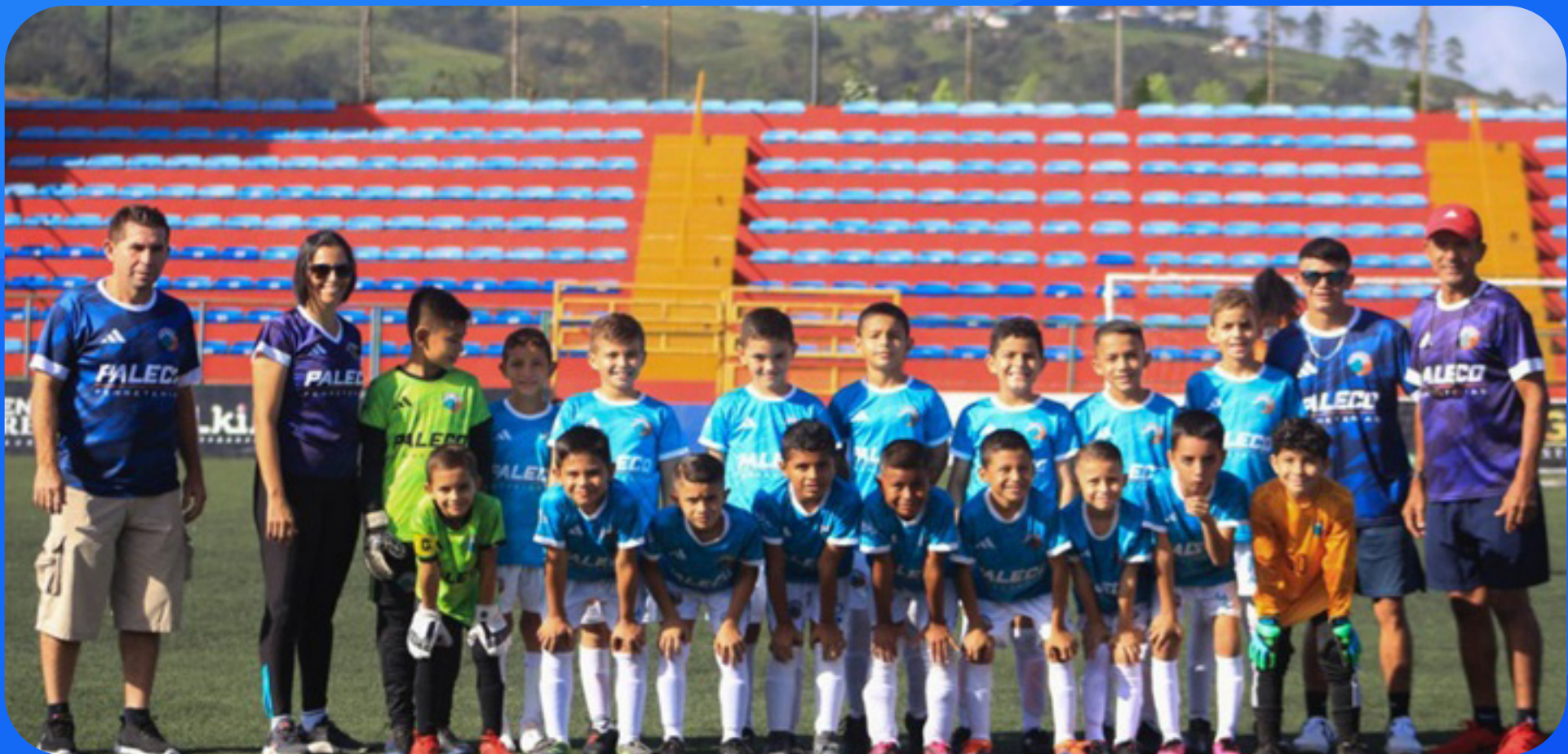
Ninth Division of the Social Welfare Soccer School, Los Angeles de La Fortuna

Through our sponsorship, the soccer school is able to cover part of the costs of renting the field so that the different groups of children can have access to training and matches in the best possible conditions.