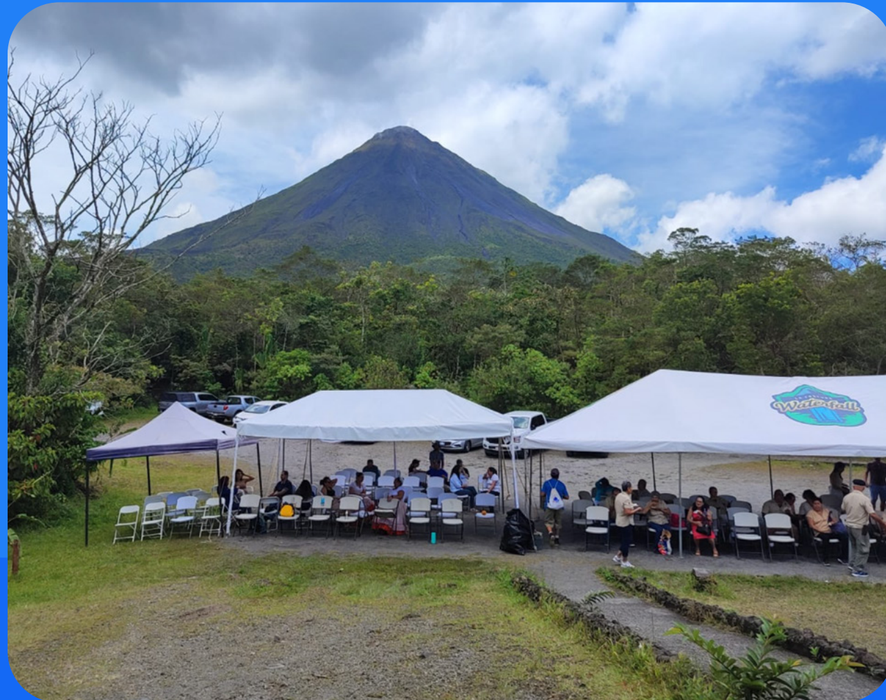
Commemoration of the 55th Anniversary of the Arenal Volcano Eruption