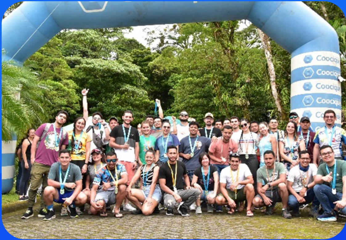
Sky Challenge 2023

The spaces for sports are beneficial for our staff in all aspects. We have a team that is highly committed to physical activity and wellness, so these activities will always be part of our priorities and our business philosophy.