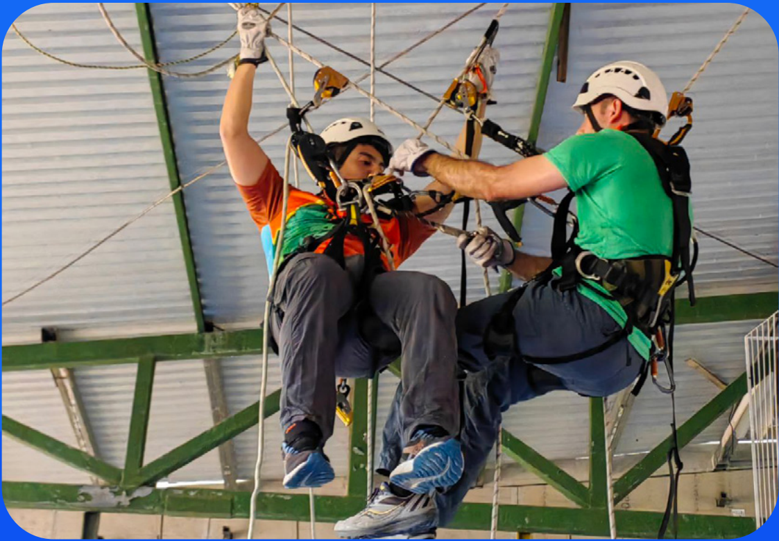
Specialized Cable and Rope Training

The professional growth of our personnel is one of our priorities, so during the year we carried out different technical trainings, according to the needs of the team.