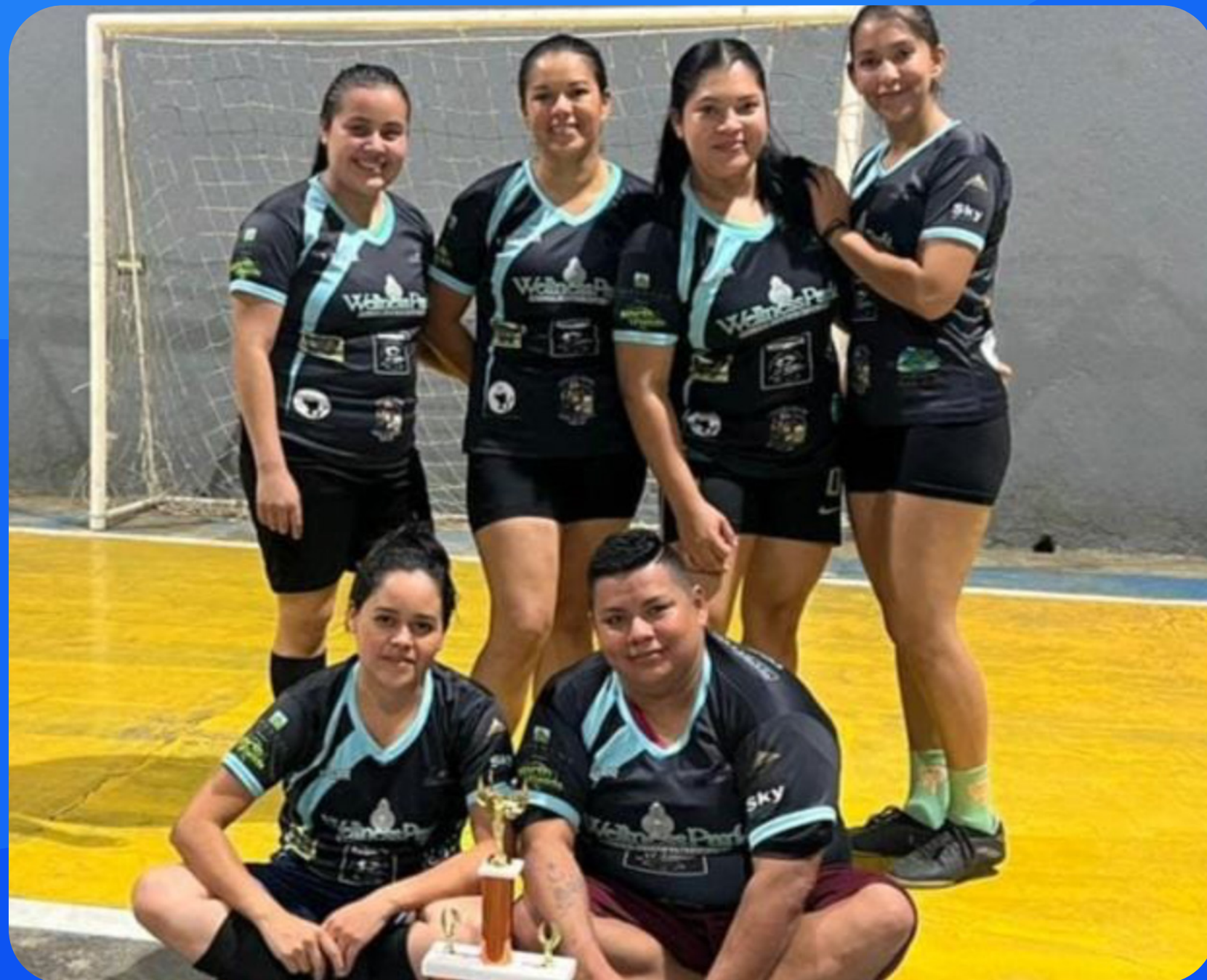
Women's Soccer Tournament in the Castillo Community

Costa Rica Sky Adventures also supported the community of El Castillo in sports activities organized by the Community Sports Committee. Thanks to our collaboration, the women's soccer team was able to make their uniforms for their participation in the community soccer tournament.