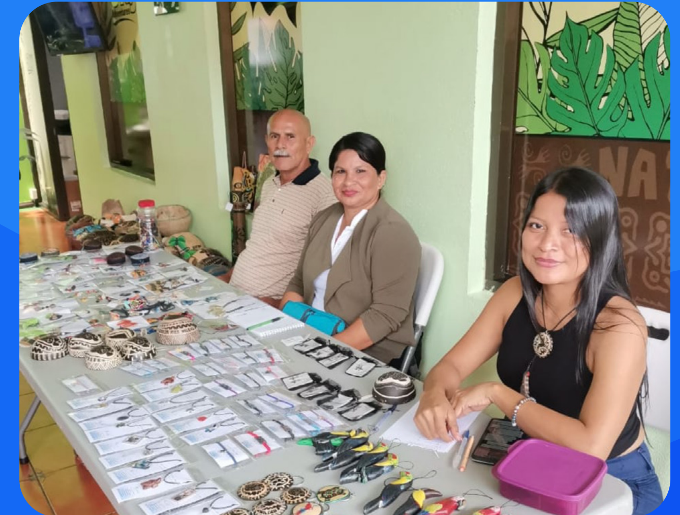
Exhibition of products made by Artisan Collectives of San Carlos and Guatuso at Sky Adventures