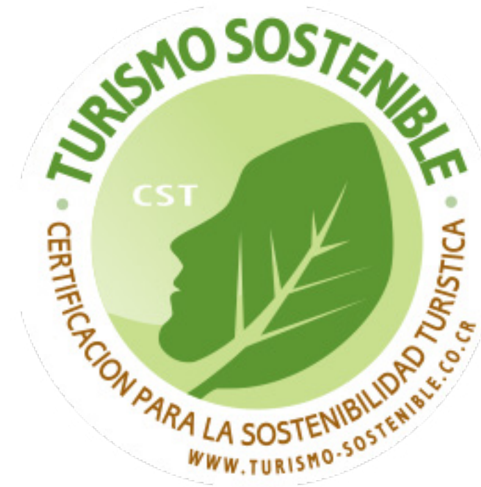
Certification for Sustainable Tourism