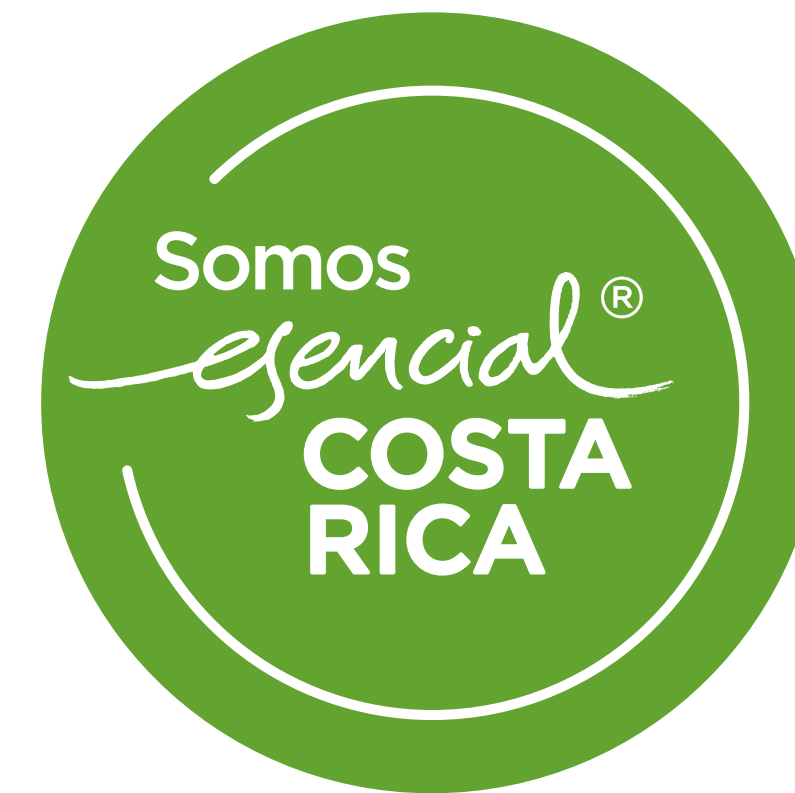
Essential Costa Rica