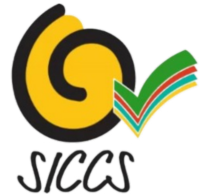
Central American Integrated System of Quality and Sustainability